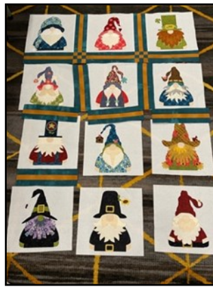
Really cute gnome blocks for a quilt