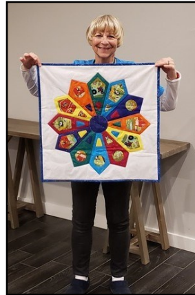
Alta Mayrose Name of Quilt: Farmland Dresden Quilted by Aleta Pattern Name: Reverse Applique Dresden Description: A 24 x 24 wallhanging will be auctioned at the North Tx Quilt Show.