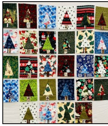
Christmas tree blocks for a quilt