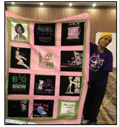
Sorority T-shirt quilt by Gwen Green

It's amazing how much better everything holds together... When there is thread on the bobbin!